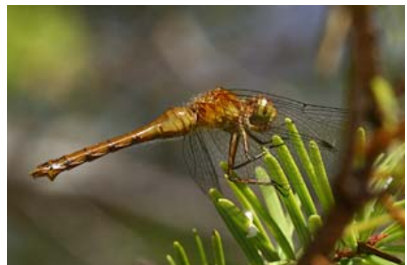
It's fall - must be an Autumn Meadowhawk