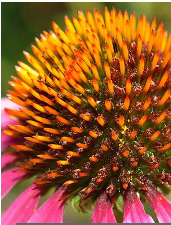
Purple Coneflower from Elkton Garden by Delia Lyons

We have some ideas for further in the future but are looking for more ideas and volunteers. The first meeting in Dec. Tom is covering sorting, storing and organizing photos and next spring Carol is doing one on Flower Power. We also have several ideas submitted such as photo restoration, water - in all it's moods, and sometime each year we try to revisit judging rules...club, 4Cs and PSA. If you have other ideas or would like to do one of these just let me know. Thanks.