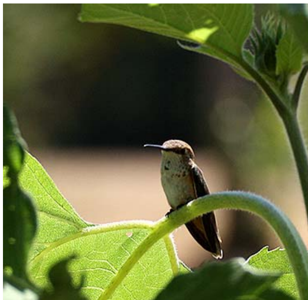
Hummingbird through Sunflower at Elkton

The PROOF SHEET is published monthly by the OREGON COAST PHOTOGRAPHERS' ASSOCIATION, INC. and is completely supported by membership dues. All articles, features and other material printed do not necessarily reflect the views of OCPA's Board of Directors, officers, membership, associated organizations or editor(s) of this publication. Any and all brands, products or business names listed are copyrighted, trademarked and / or registered and are not necessarily endorsed by OCPA (other than our corporate sponsors).