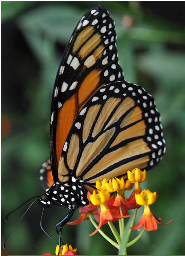
Monarch on Milkweed at Elkton