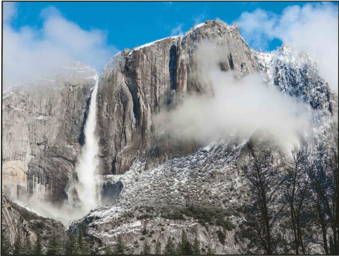
2 nd Place – Elise Ciruolo – Upper Falls – Traditional Color Print - 11/04/2024