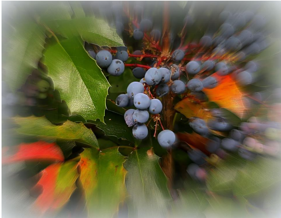
3rd Place – Thomas Konomos – Holly Crap – Altered Realty - 10/21/2024