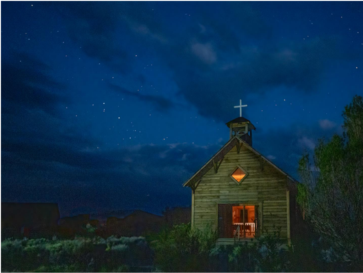
2 nd Place Tie – Elise Ciralo – Fort Rock Church – Traditional Color - 11/04/2024