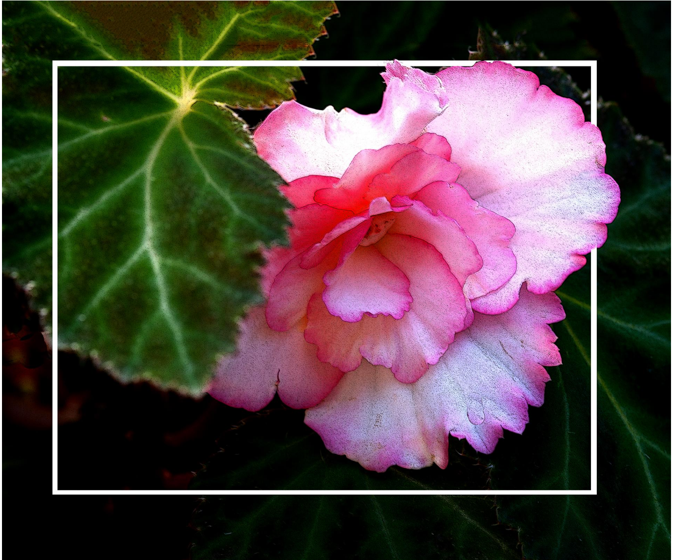
2nd Place – Carol Todd – Camellia – Altered Realty - 10/21/2024