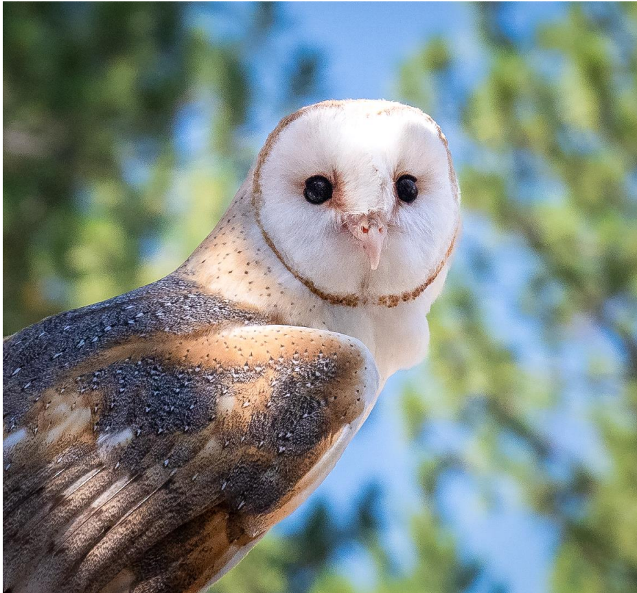
2 nd Place Tie – Elise Ciralo – Barn Owl Portrait – Traditional Color - 11/04/2024