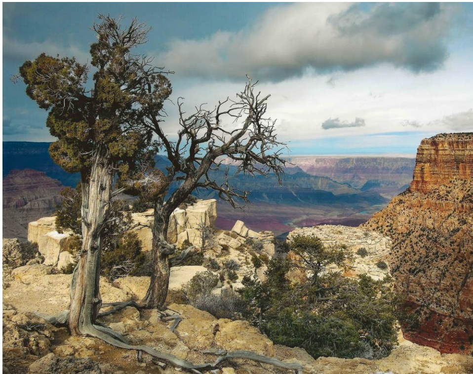
3 rd Place – Elise Ciruolo – Clouds Over Canyon – Traditional Color Print - 11/04/2024