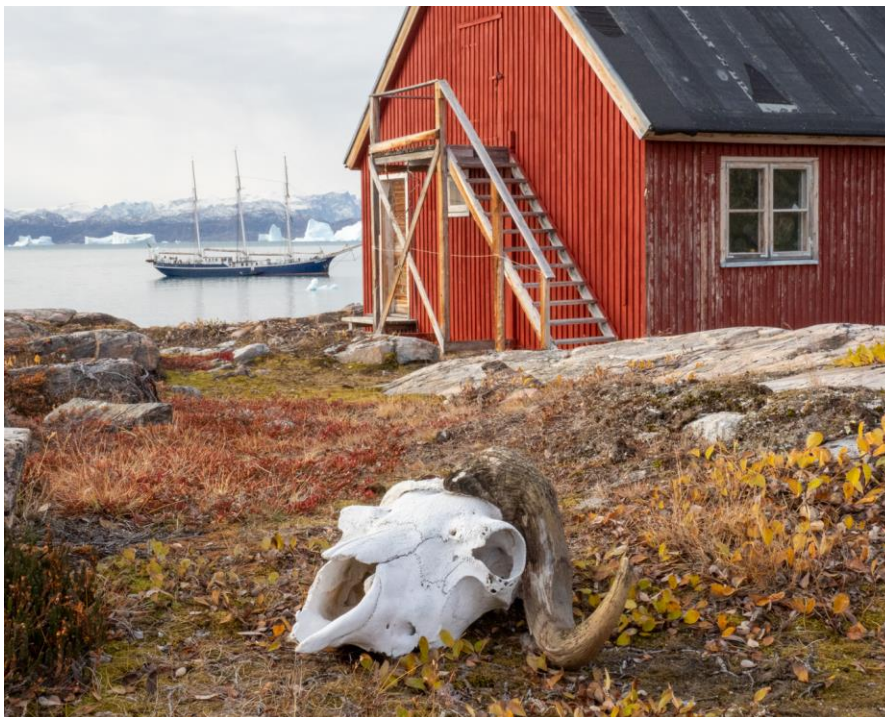
1st Place Tie – Elise Ciruolo – Greenland Hunting Lodge – Traditional Color - 11/04/2024