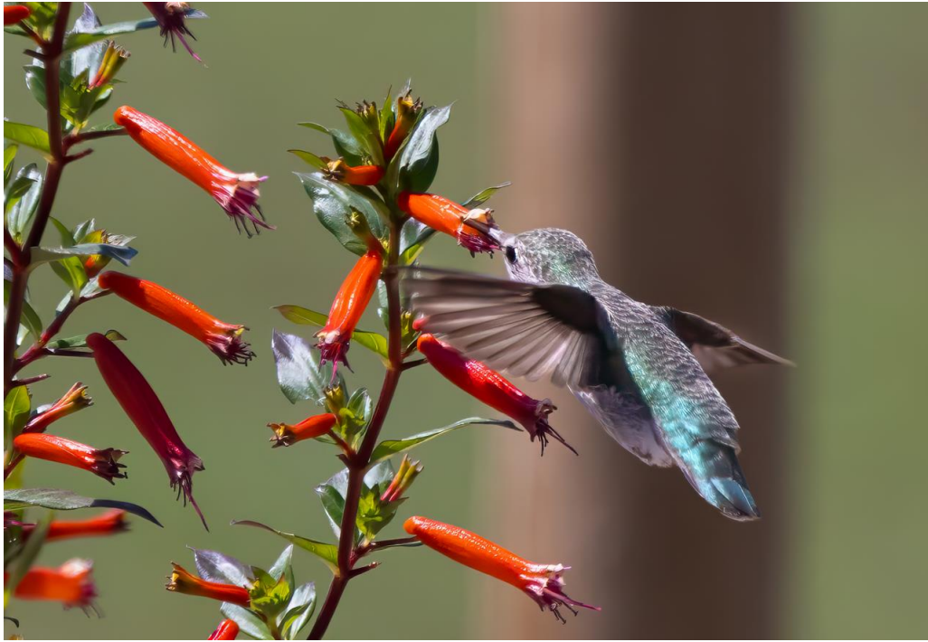
3rd Place – Bill Kuhlemeier – Hummer Fueling – Traditional Color EID - 11/04/2024