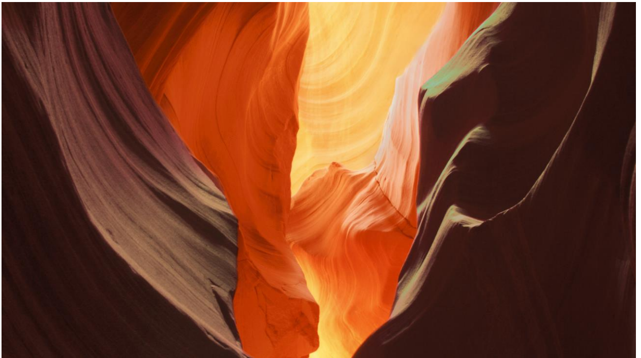
2nd Place – Blayden Thompson – Slot Canyon – 4/7/2025 – Color EID