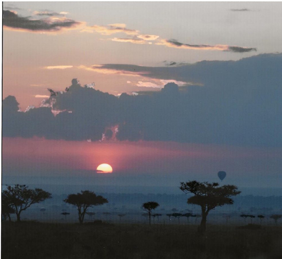
3 rd Place – Elise Ciraolo – Kenya Sunrise – 4/7/2025 – Color Prints