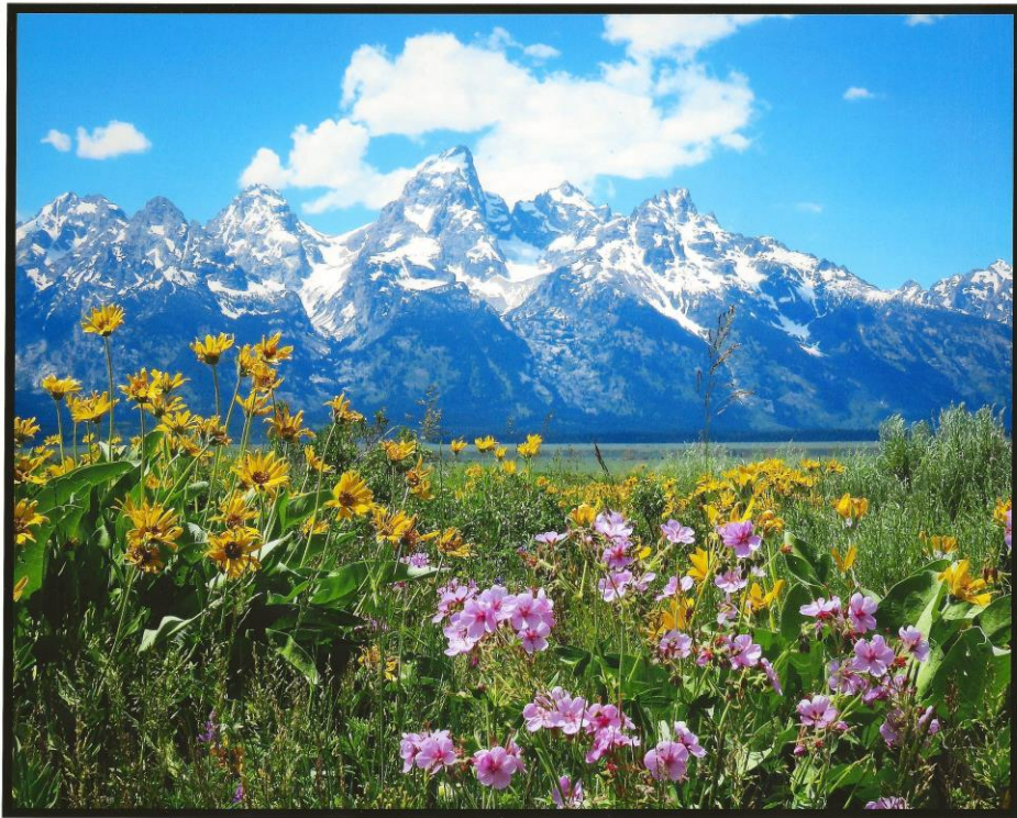
1st Place – Tom Branderhorst – Beautiful Mountains – 4/7/2025 – Color Prints