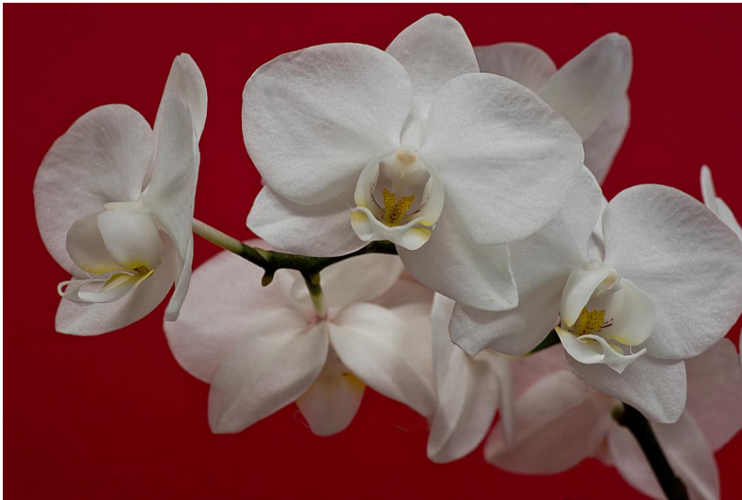
2nd Place – Don Todd – White Beauty – Traditional Color EID February 2024