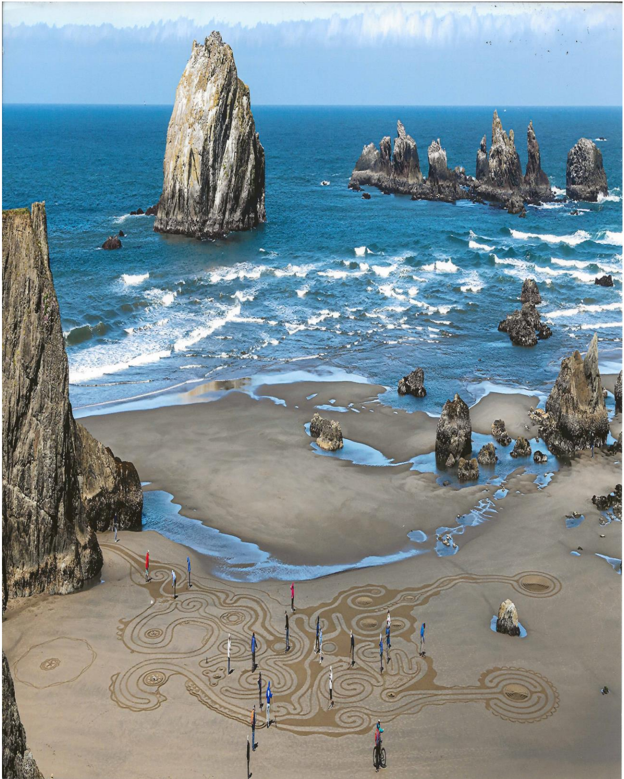
2nd PI – Roy Burnett – Cardboard People – Traditional Mono Prints March 2024