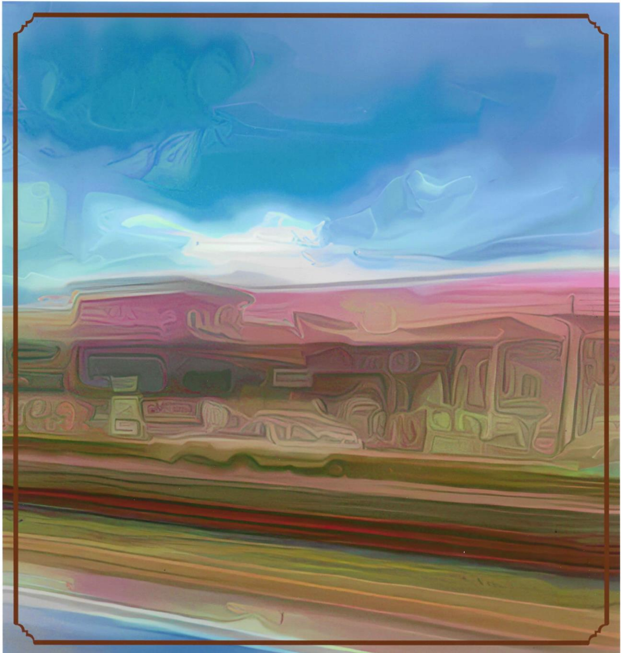
3rd PI – Renee Marcov – Cruisin 101 – Traditional Mono Prints March 2024