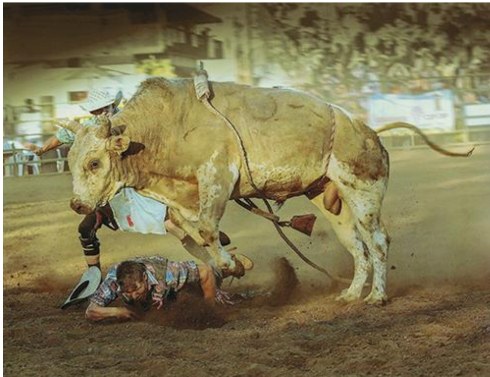
“Untitled” By Thomas Konomos First place Traditional Color Print