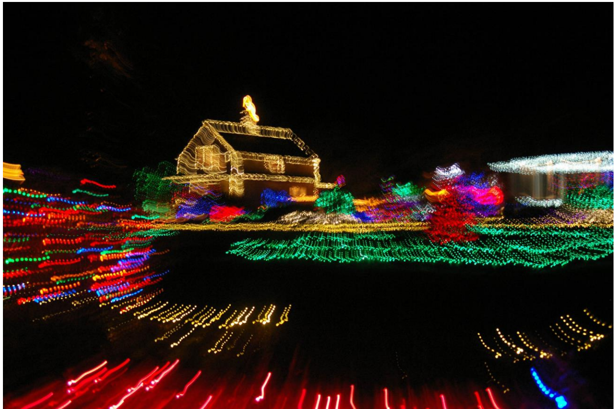
Christmas Eve at Shore Acres