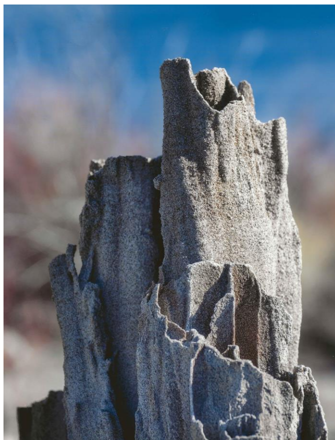
2 nd Place – Elise Ciralo – Sand Tufa – 11/6/2023 Color Prints