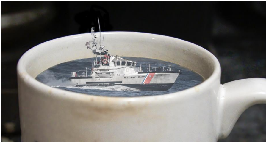
1st Place – Al Hurt – Dreaming – Altered Reality 10/16/2023