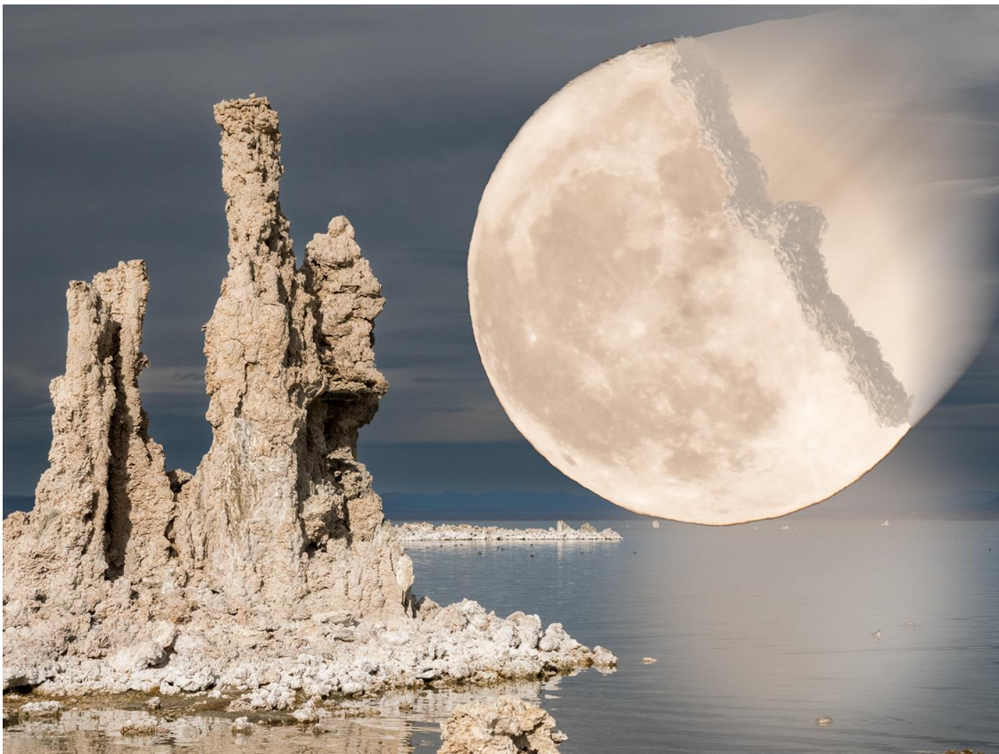
3rd Place – Elise Ciraolo – Moon Attack – 10/16/2023 Altered Reality