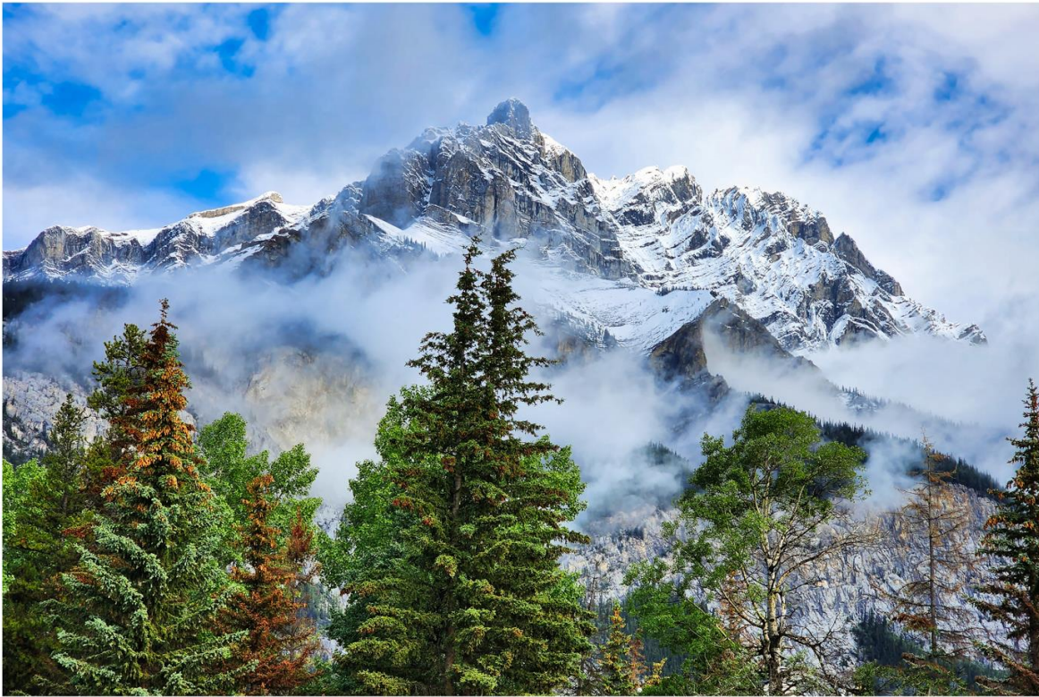
2nd Place – Linda Petersen – Snowy Mountaintop – 1-8-2024 – Color EID