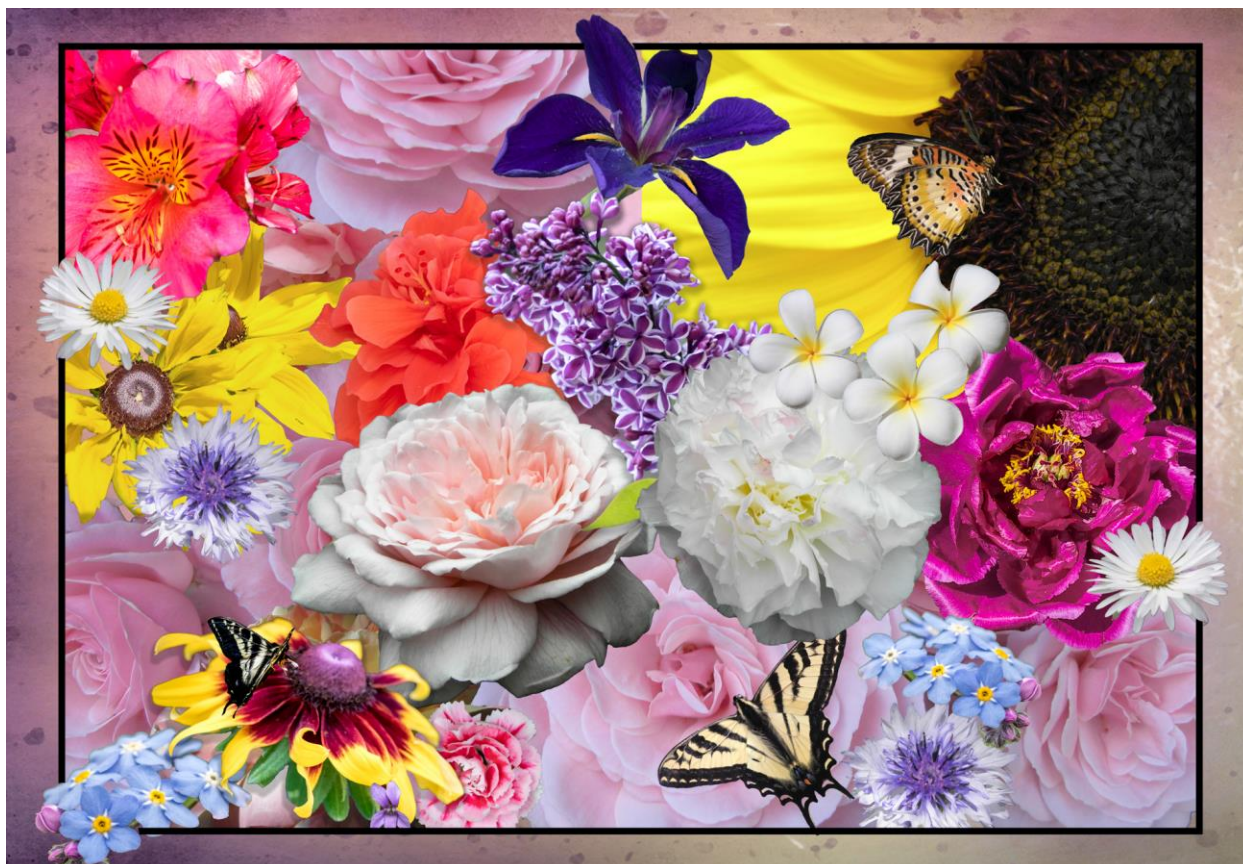
3rd Place – Linda Petersen- Flower Collage – 12-4-23 - Altered Reality