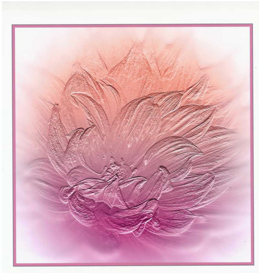
Pink Flames – 3 rd Pl. Altered Reality Print Elise Ciruolo