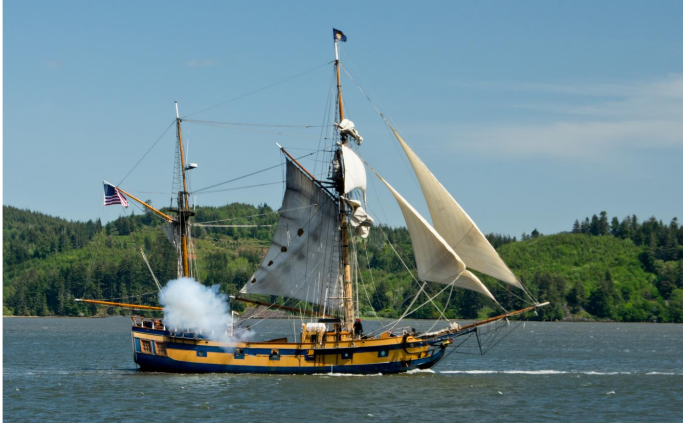
The Bounty by Don Todd

The Bounty was lost off the North Carolina coast during Hurricane Sandy. This wonderful reproduction used to visit Coos Bay regularly. This image was taken during one of those visits.