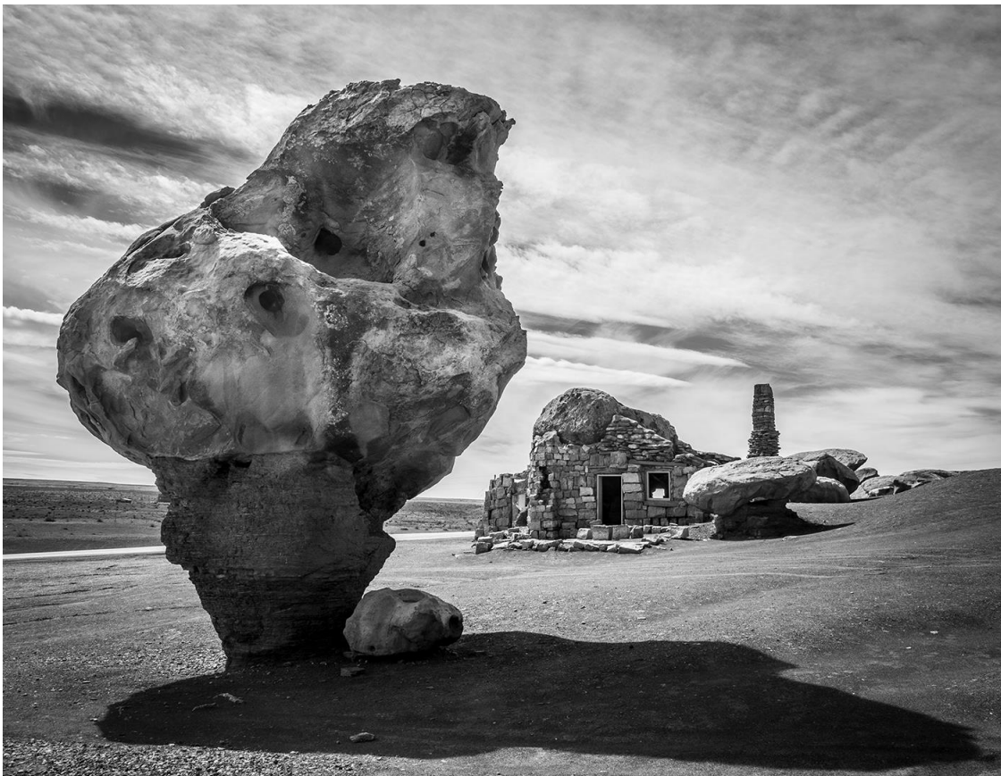
HM Mono – Elise Ciruolo – Balancing Rock