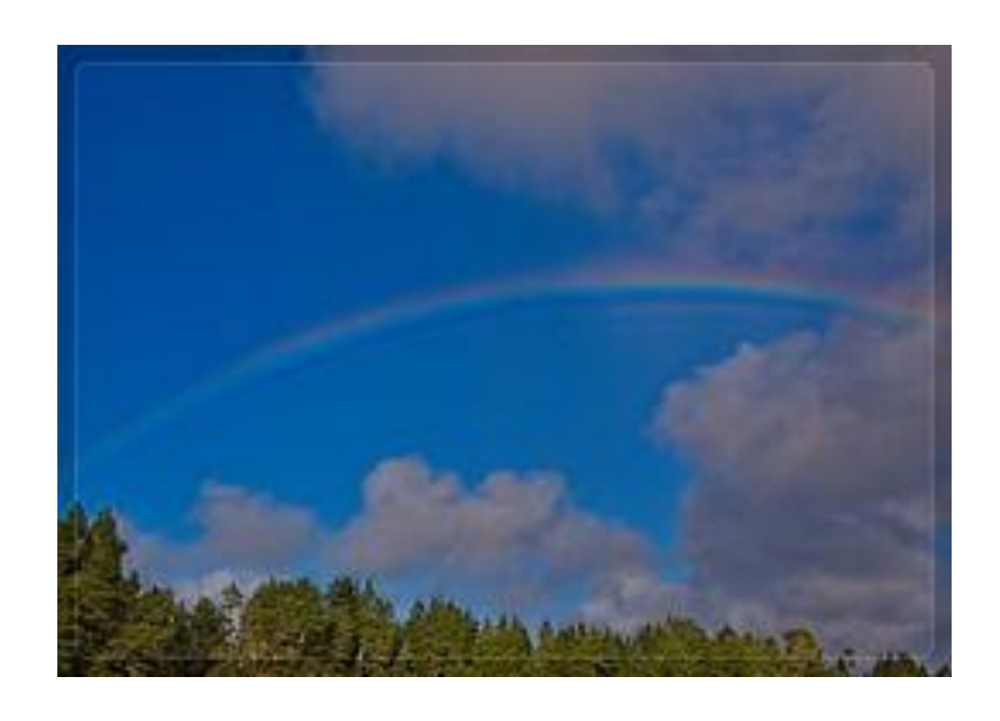
Leslie's: Last Image