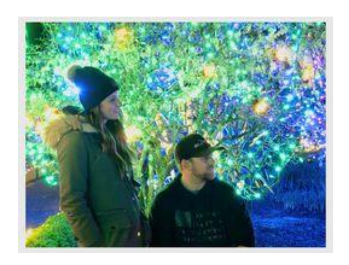
Linda's: Last Image