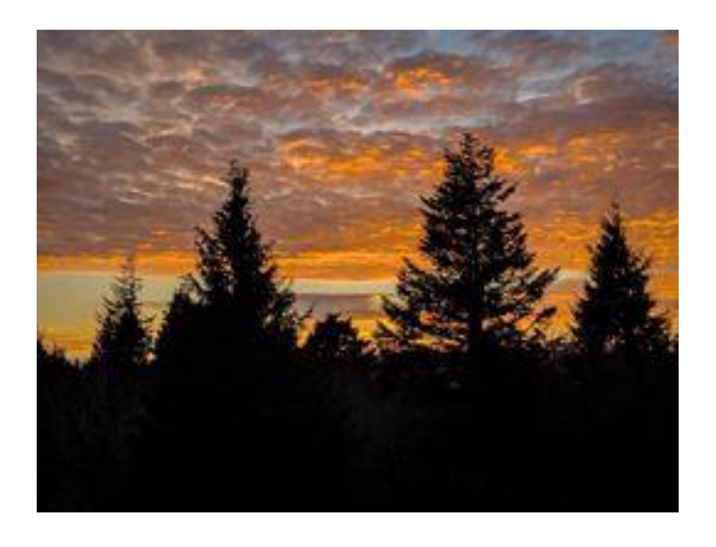
Renee's Final Sunset