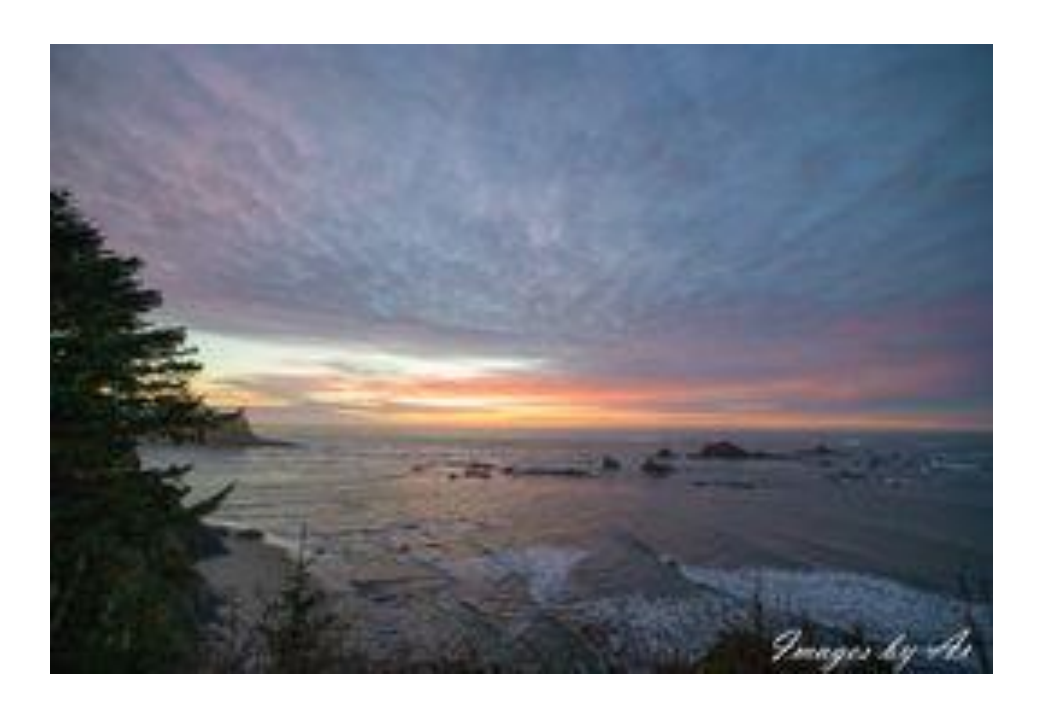
Al's: Last Image