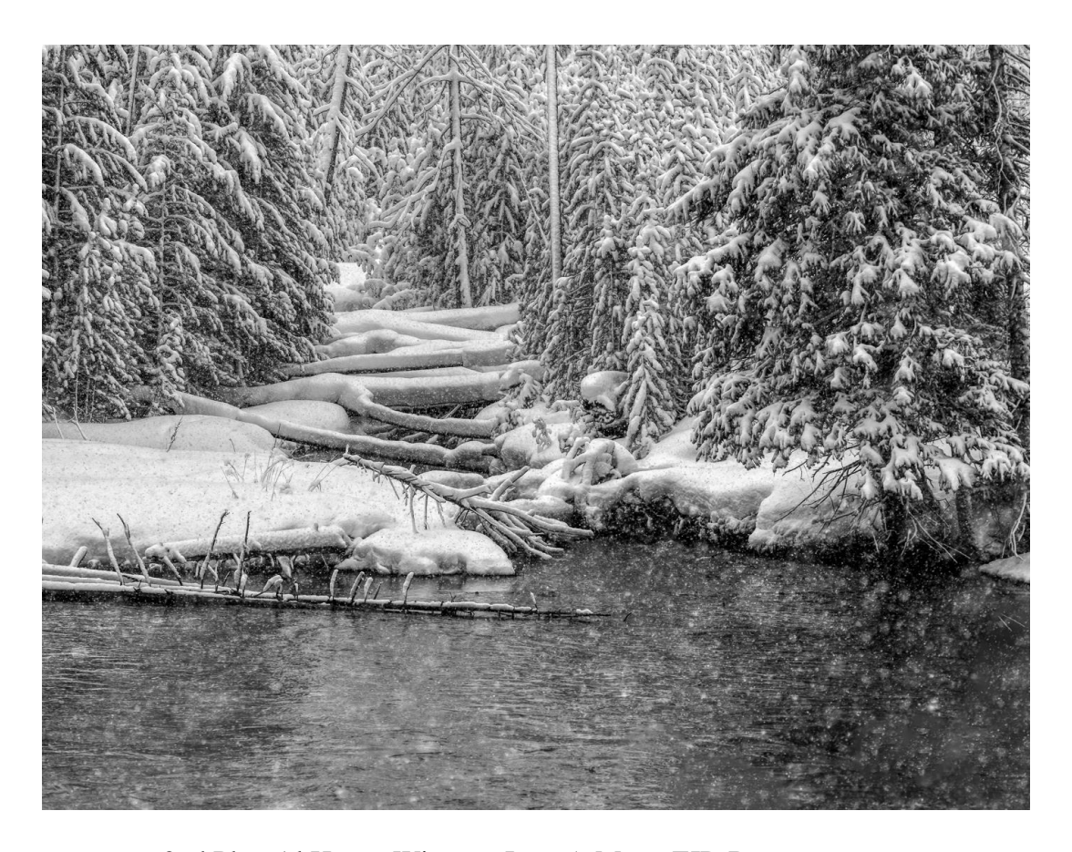
2nd\ Pl.-Al\ Hurt-Winter-June\ 5\ -Mono\ EID\ Bonus