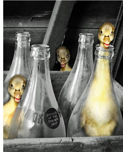
AM Winner Getting Into Mischief

Yamhill Valley Camera Club Juried May's (and the final for the year) 4Cs' Electronic Monthly Competition. 100 images were submitted by 19 clubs. You needed a score of between 27 and 24 to receive an Award of Merit, and 24 for an Honorable Mention. OCPA is in 16th Place overall, but EOY rankings will change after they are adjusted (lowest month's score will be deleted) and announced at the 4C's Annual Convention this October in Walla Walla.