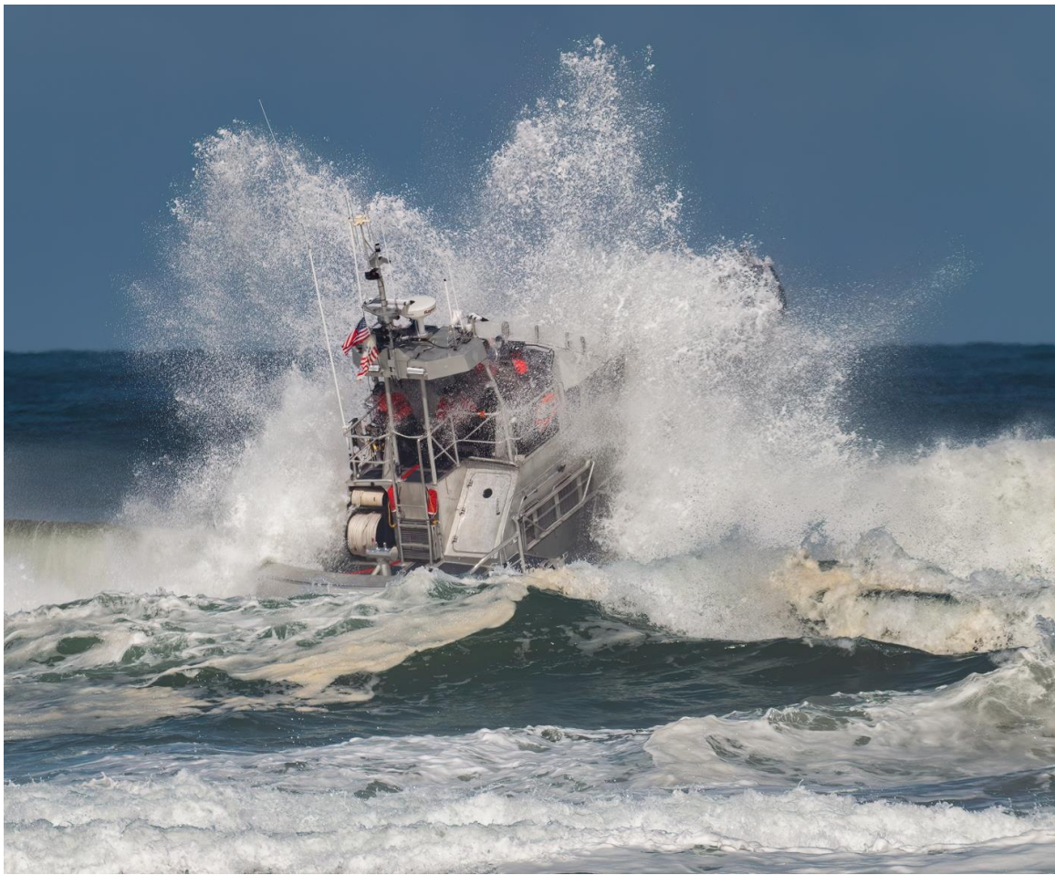
1st Place – Al Hurt – Playtime – Color EID April