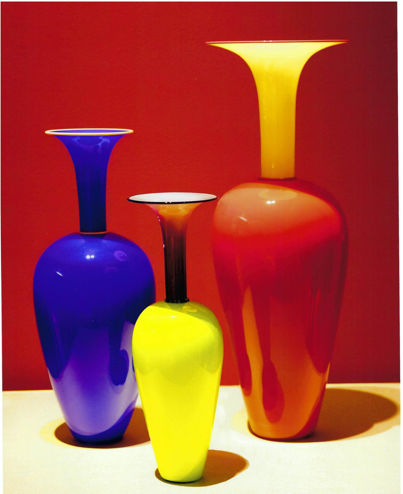
2nd Place – Roy Burnett – Color and Color – April Traditional Color Prints