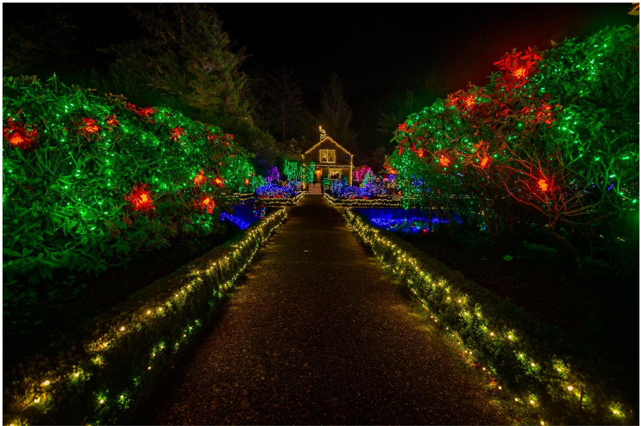
1 st Pl. – Al Hurt – Christmas Lights 2 – Jan 22, 2024 – Christmas Lights Competition