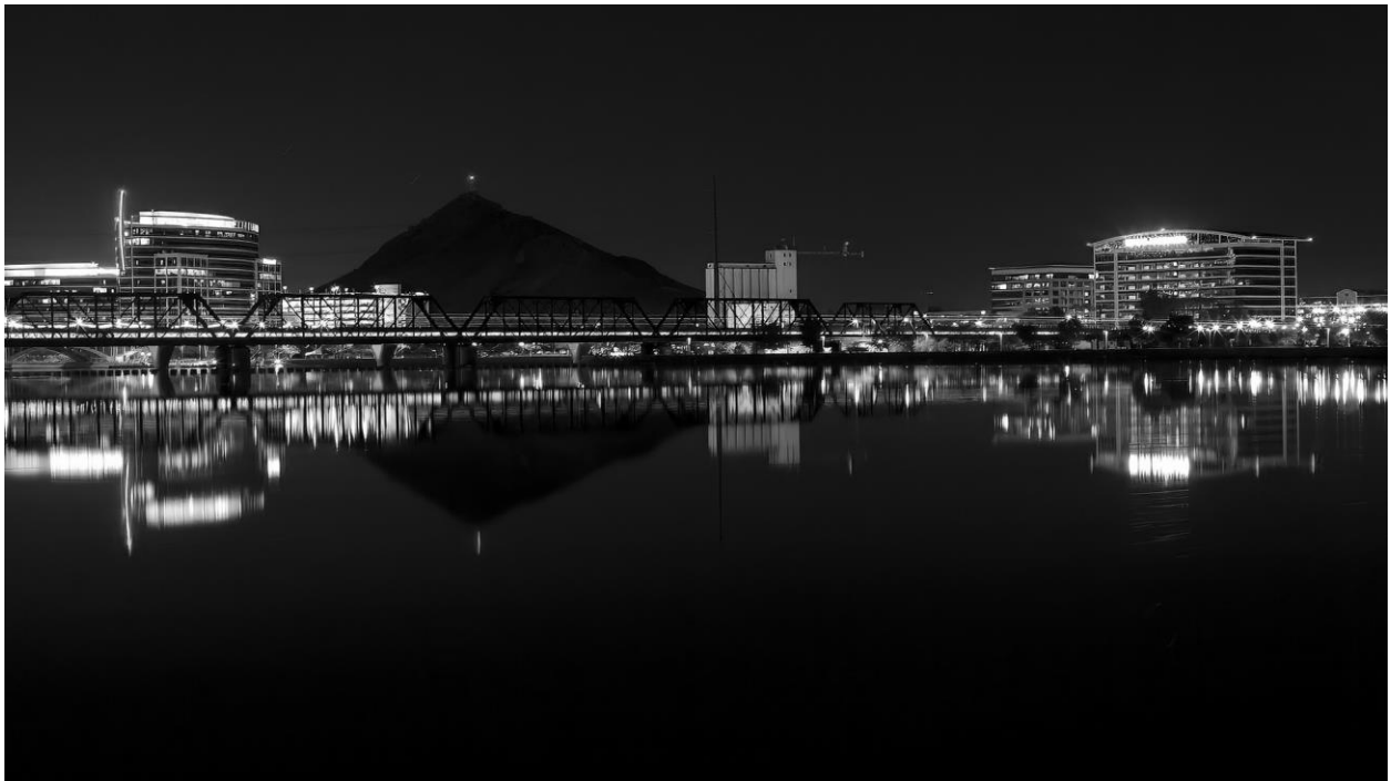
3rd Place – Blayden Thompson – Phoenix Lake Bridge – Jan. 22, 2024 – Mono EID