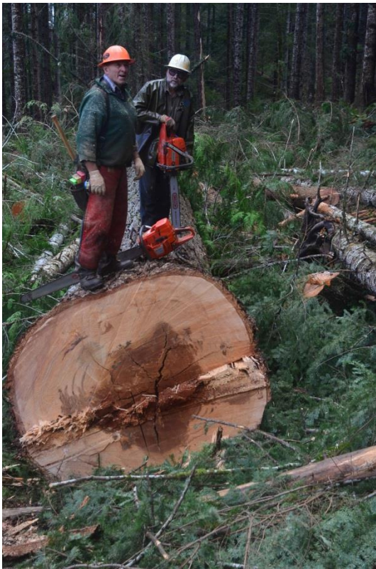
Notice the rotting center