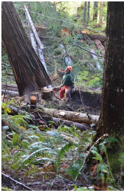
cutting a big cedar