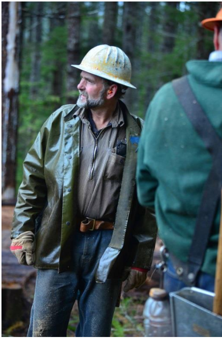
The Rookie 35 Years experience