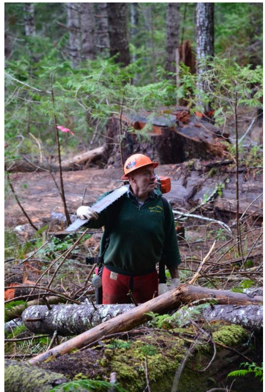
Going to the next tree