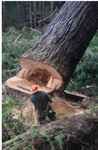
Picking up speed