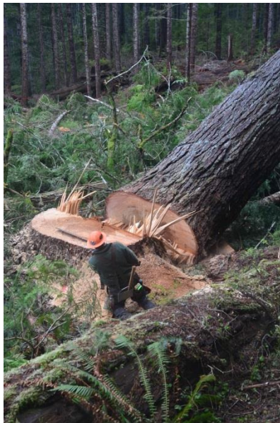
Almost all the way