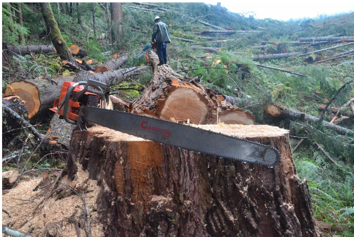
The big saw on cedar

So there you have it. I recommend this trip as it puts you deep into the forest with some wonderful photo ops. In closing, remember to f8 & Be There and I wish you a Sunny 16.