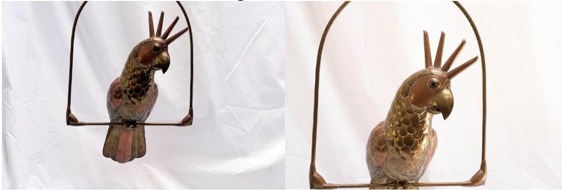
Taken with a7R III