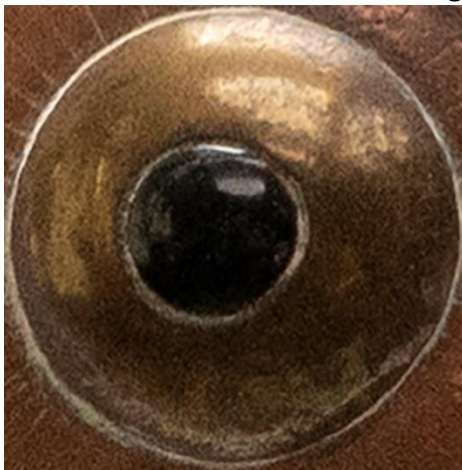
Taken with a7R III 200.3kb file size