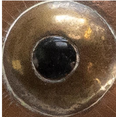
Taken with a6600 212.8kb file size

As to whether it produces better quality to crop the full-size sensor of the a7R III or shoot the long shots with the APS-C of the a6600...I am still not really sure. My best guess is that it is marginally better going full size (just a feeling). I think it took a little higher blow up to start pixilating at full size. I did one other thing with the 300% crop images. I blew them up until they filled the entire screen of my 27" monitor. The APS-C read 488.19% at this size and the full-size sensor read 504.96% bearing out the slightly larger APS-C file size.