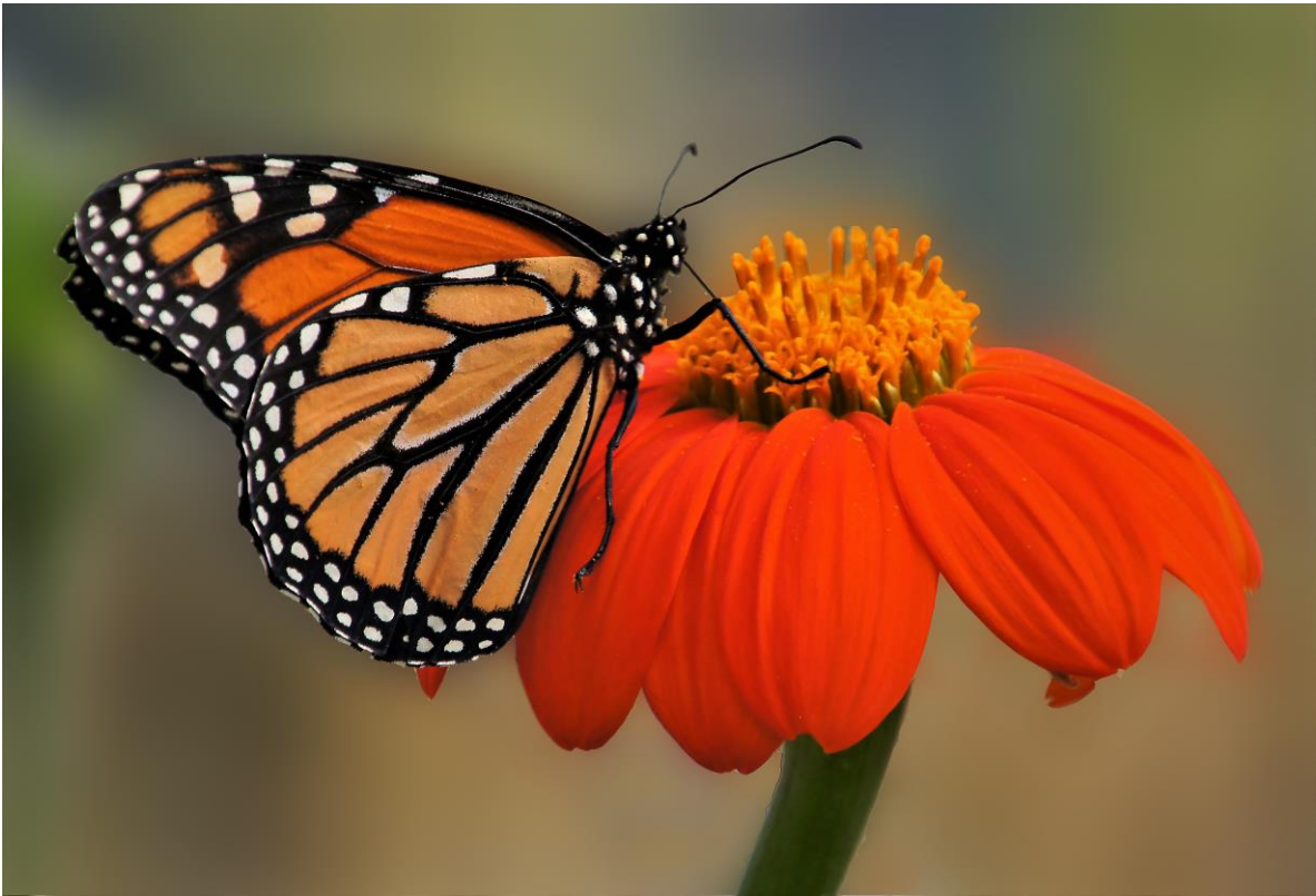
2nd Pl – Ron Irvin – Dining Out Alone – Color EID – April 2024