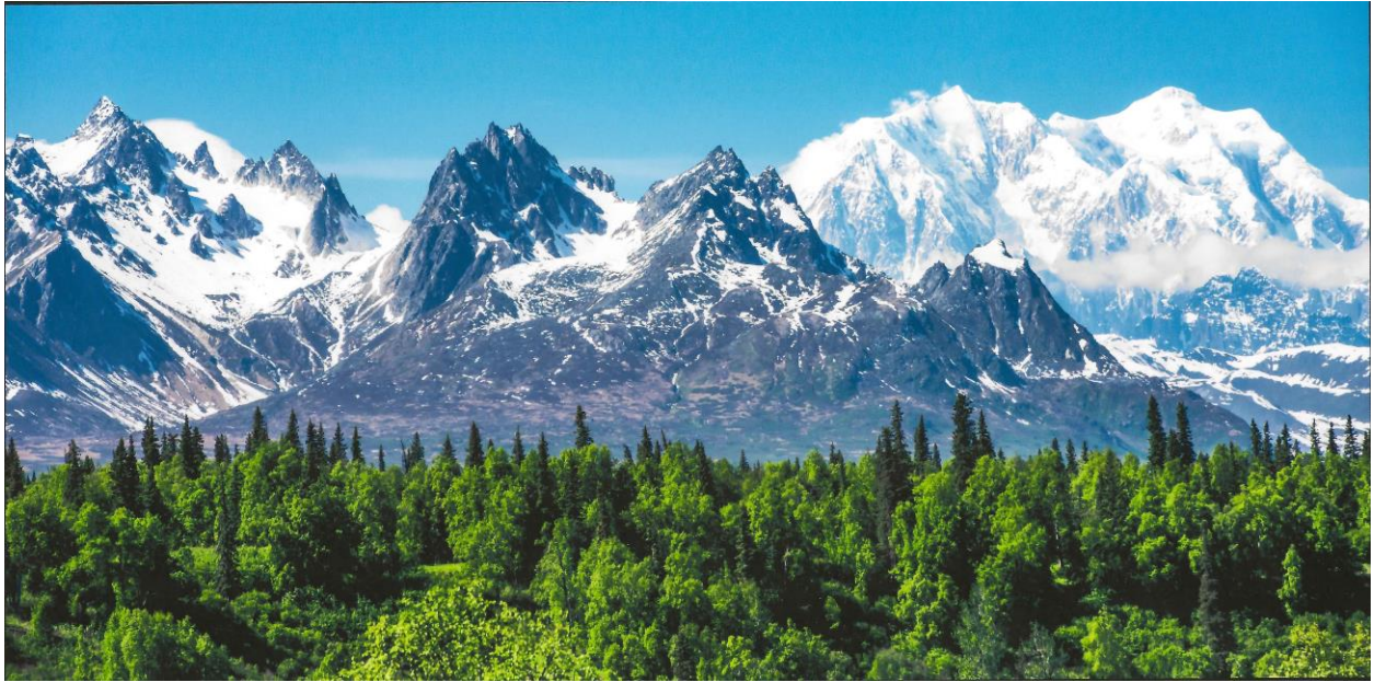
3rd Pl Tie – Elise Ciralo – Mountain So High – Color Prints – April 2024