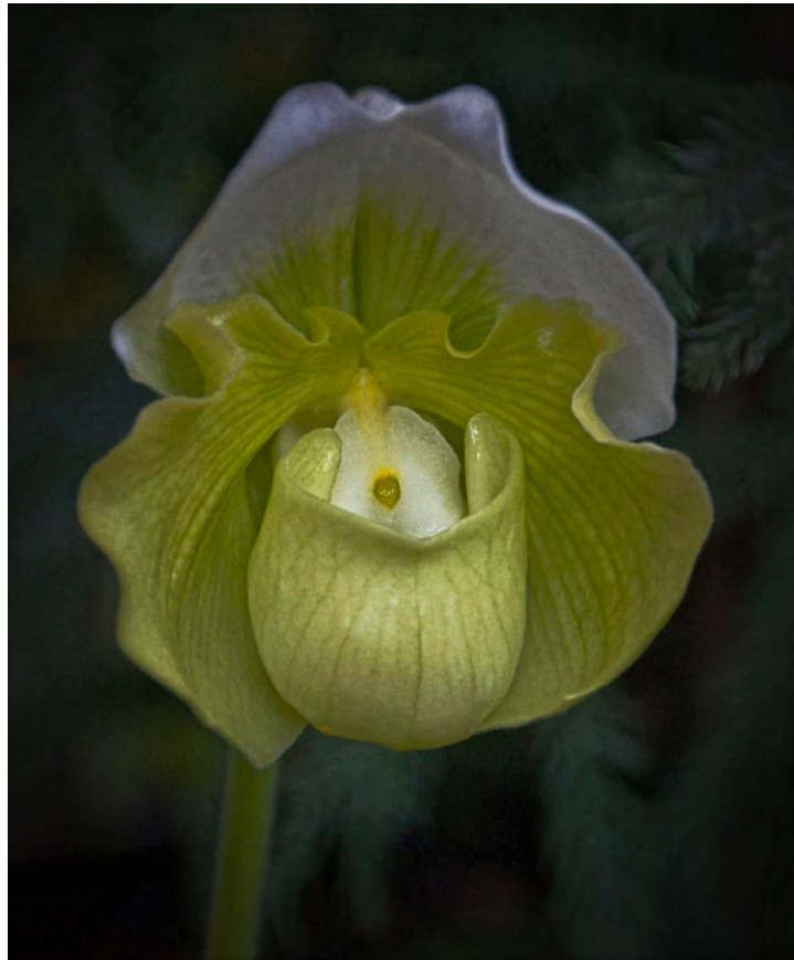
3rd Pl Tie – Ron Irvin – Eunique Flower Design– Color EID – April 2024