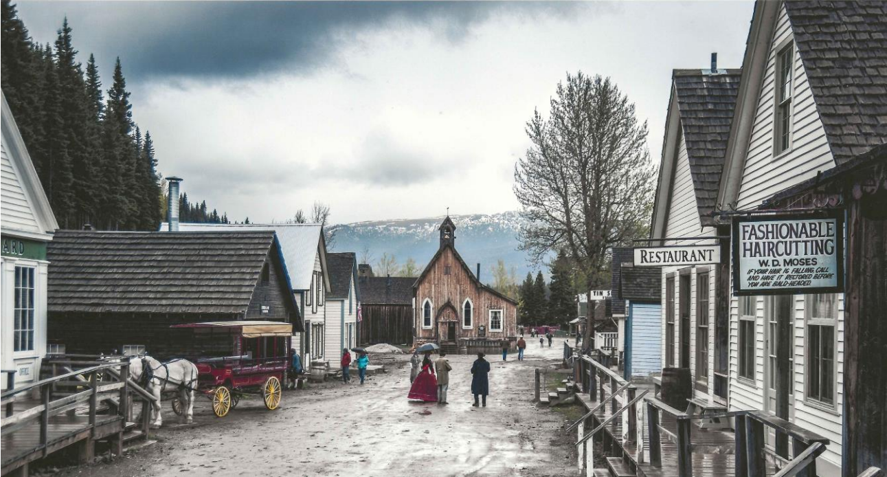
1 st Place – Elise Ciraola – Road Through Barkerville – Color Prints – April 2024