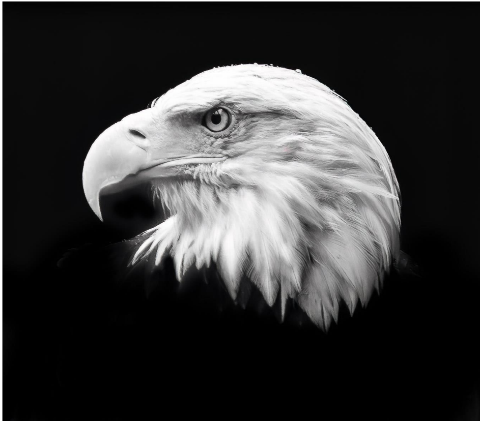
1st Place – Steven Mackey– VINS-Owl 6 – Mono EID – 10/2/2023