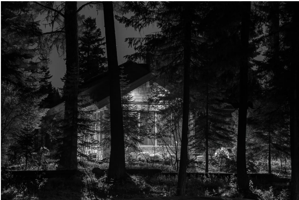
2nd Place – Al Hurt– Cabin in the Woods – Mono EID – 10/2/2023