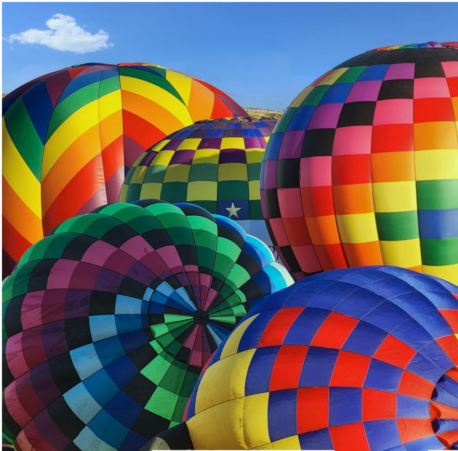
2 nd Place – Linda Petersen– Bright Colors - EID – 9/18/2023