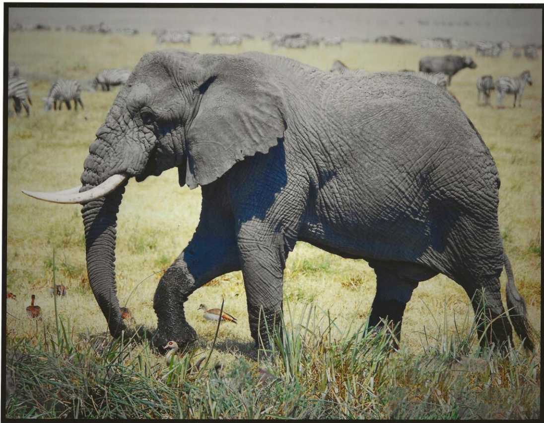
1 st Place – Tom Branderhorst– Big Boy – Color Prints – 9/18/2023