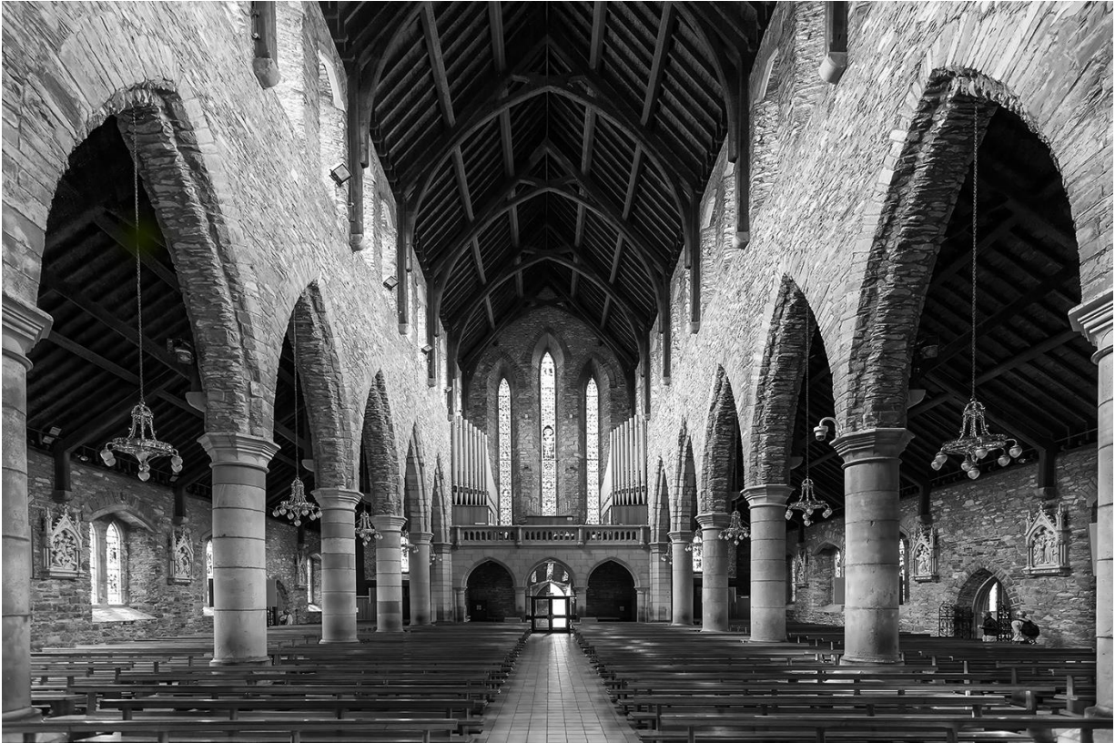
1 st Place – Blayden Thompson– Ireland – Mono EID – 10/2/2023