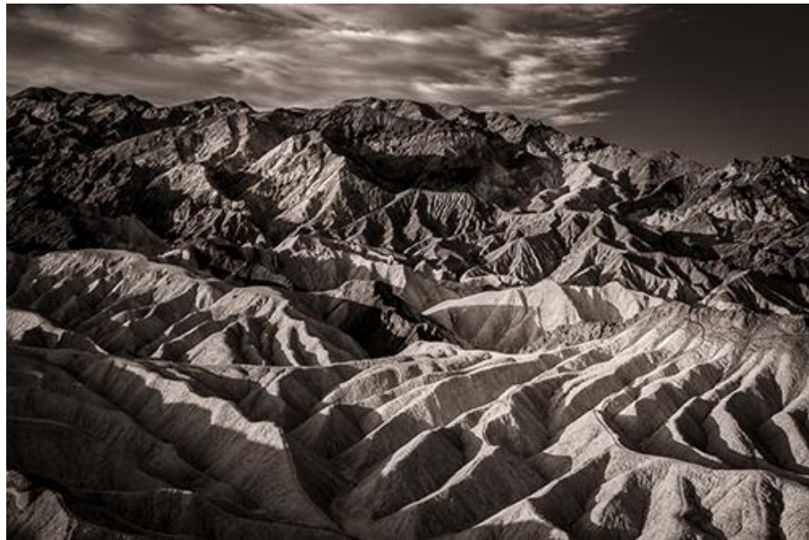
1 st Place Traditional Monochrome Tony Mason - Erosion of Time