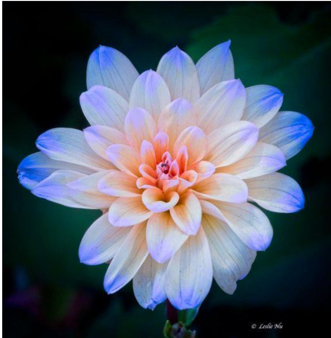
Leslie Nu, Shore Acre Flower