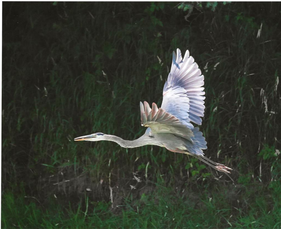
2nd t Place – Tom Branderhorst – Flying Heron – Traditional Color Print